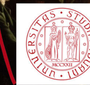
Università degli Studi di Padova