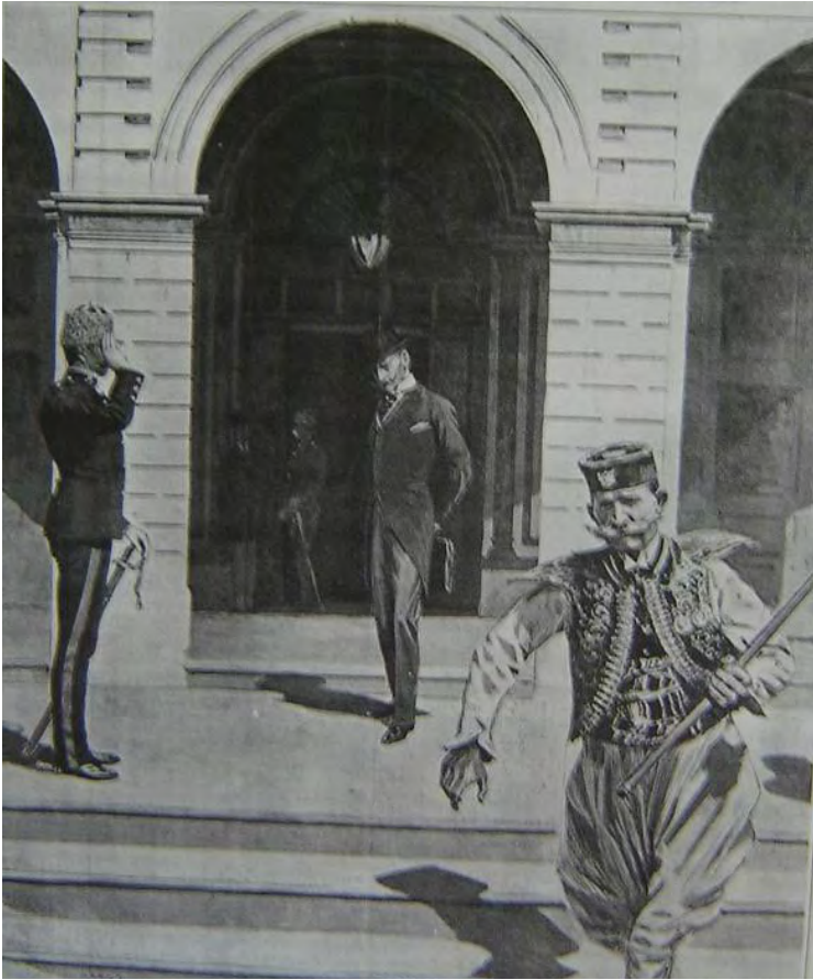
Montenegro Breaking Relations with the Ottoman Empire, the Montenegrin Minister Waiting on the Step of the Sublime Porte for the Carriage After Having Demanded his Passport, The Illustrated London News , 12 October 1912.