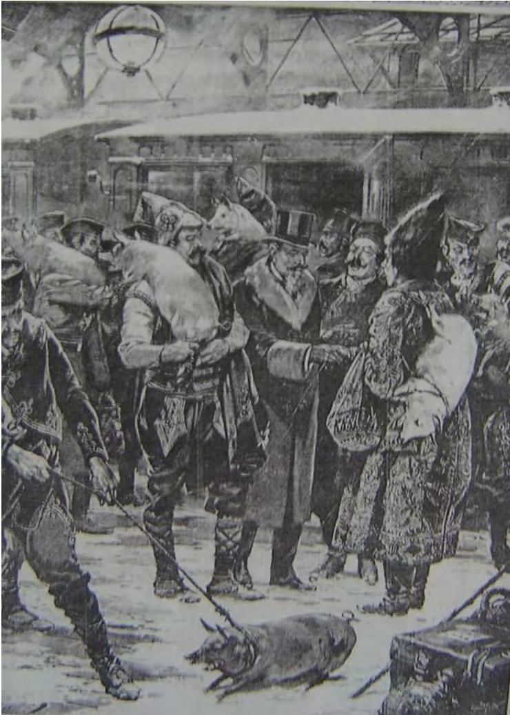
Pig and Politics: Servian MP's Taking Home Living Pigs for the Christmas Dinner, The Illustrated London News , 26 December 1908.