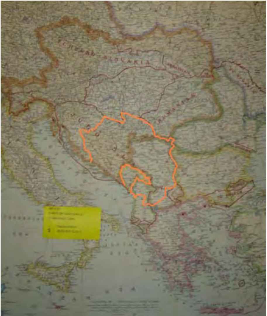
Plans for the dissolution of the Austria-Hungary (1917), PRO, MPI 1/397