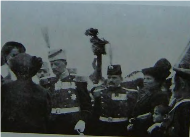
General Popović and Lady Paget at Railway Station of Skoplje 1915.