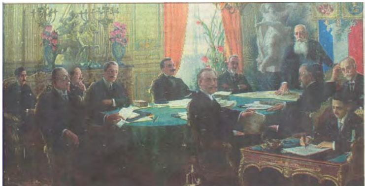
Government of the Kingdom of SCS, presided by Nikola Pašić

The Jugo-Slav desire that the boundaries of their prospective Confederation shall be determined on ethnological lines, and upon this basis they lay claim to extensive territories. This would include, in addition to Serbia, Montenegro, Croatia, Slavonia, Bosnia, Herzegovina, and Dalmatia, portions of Carinthia and Styria, the whole of Gorizia, Carniola, Istria, and the coast, together with islands down to the Albanian frontier. The northern frontier of their State would run approximately from Graz in a south-easterly direction along the Drave, then north of the provinces of Baranja,