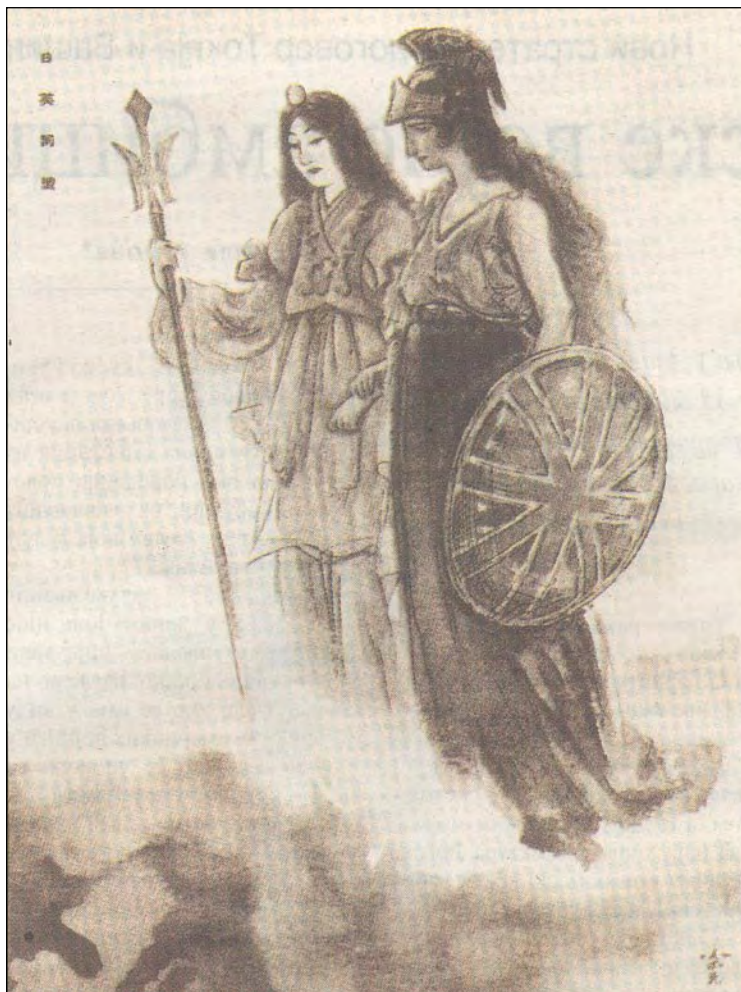
Ango-Japanese Alliance, contemporary caricature